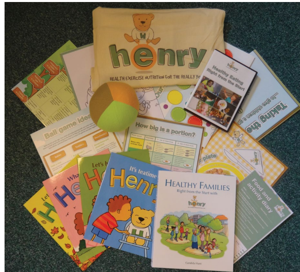
The HENRY Parent Toolkit – free to everyone joining a HENRY programme

The HENRY toolkit will help you give your child a great start in life, get the whole family involved, and keep track of how well you're doing.